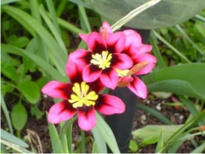
Tips to Spring into

Did You Know...some simple tips that can help keep your home in good working order for spring.